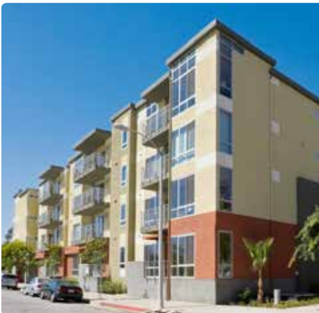
Large residential complex