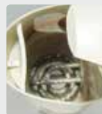
Inside a kettle