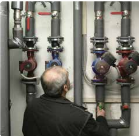
Piping system in an apartment building