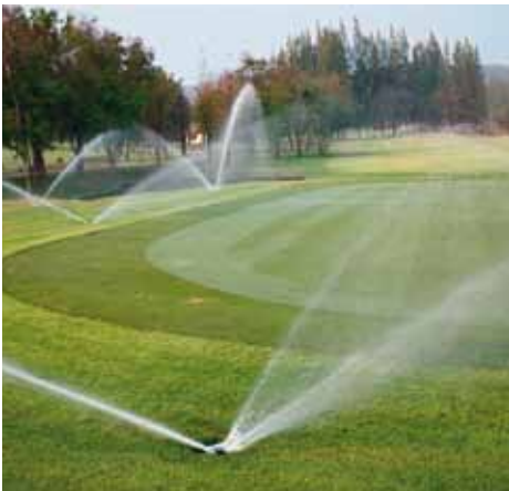
Sprinkler system in a golf course