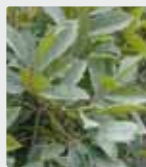
Plants and turf