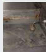
Grill plate in a restaurant/clubhouse