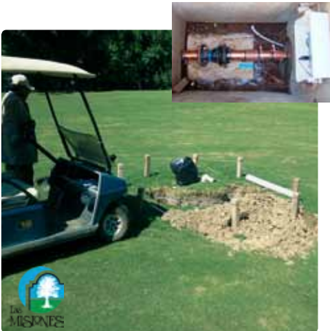
Vulcan installed underground at Las Misiones Golf Course