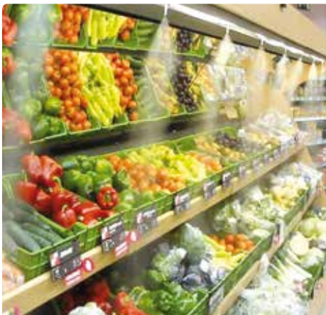
Misters in food section