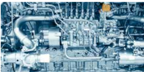
Kitchen appliances (top)