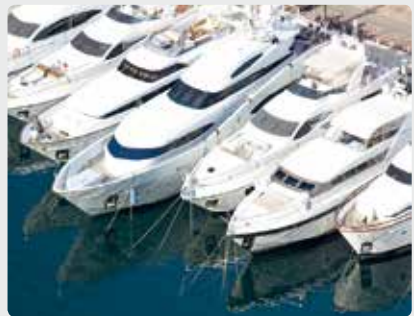
Yachts in harbour

Vulcan water treatment is the eco-friendly and salt-free solution to prevent scale and corrosion on yachts.