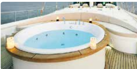
Jacuzzi on the deck of a luxury yacht