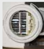
Swimming pool filter